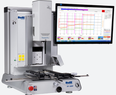
To view a complete list of Heat-Focusing Nozzles available for the ThermoFlo® Systems Please visit Paceworldwide.com for more information.

The Inductive Convection Heater pre-heats the air in a cyclonic fashion around the induction coil before entering the inner chamber, where the air is instantly heated to the target temperature. The low thermal mass design then allows the coil to cool down at a faster rate, consistently yielding high quality solder joints.